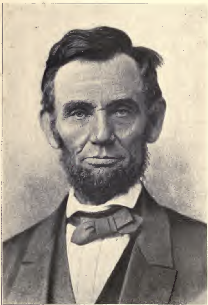
PRESIDENT ABRAHAM LINCOLN, 1864